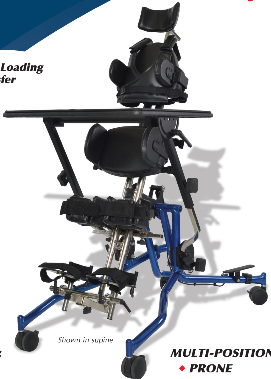
Shown in supine