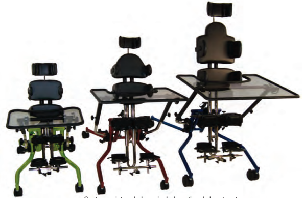
Systems pictured above include optional clear tray top.

These units include: High-loading platform ht; Folding base and components to support Prone, Vertical, Supine or Multi-Position configurations. Packages include: Hip pad with laterals, Chest pad with laterals, Support vest; Soft hip pad; Headrest; Chinrest; Multi-Position foot system; Opaque tray; Hands free standing angle adjustments; Height and depth adjustable knee pads; Lock out block and Upgraded steel locking casters. This packaged system can be accessorized and quoted to fit your client's needs with the items listed on this page.