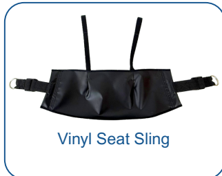
Vinyl Seat Sling