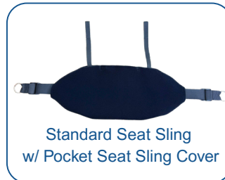
Standard Seat Sling w/ Pocket Seat Sling Cover