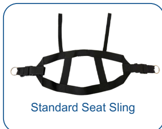
Standard Seat Sling