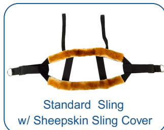
Standard Sling w/ Sheepskin Sling Cover