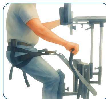
Mike at 6' tall in Granstand III