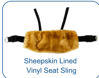
Sheepskin Lined Vinyl Seat Sling