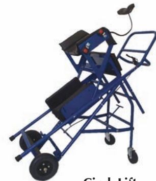
CindyLift Patient Lift / Transfer Device