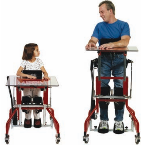
Granstand III Modular Standing System