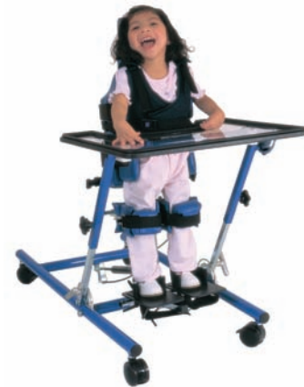
Superstand / Superstand Youth Pediatric Multi-Position Stander