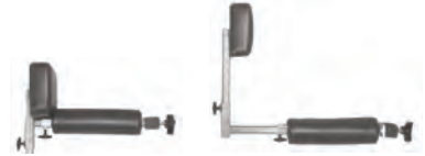
Height Adjustable Pommel With Rigid Hip Pad

Custom Support Pads: Use this area only if you need custom-sized support pads on your Superstand. All custom pads must be quoted for price and manufacturing time.