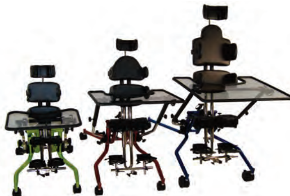
Systems pictured above include optional clear tray top.

These units include: High-loading platform ht; Folding base and components to support Prone, Vertical, Supine or Multi-Position configurations. Packages include: Hip pad with laterals, Chest pad with laterals, Support vest; Soft hip pad; Headrest; Chinrest; Multi-Position foot system; Opaque tray; Hands free standing angle adjustments; Height and depth adjustable knee pads; Lock out block and Upgraded steel locking casters. This packaged system can be accessorized and quoted to fit your client's needs with the items listed on this page.