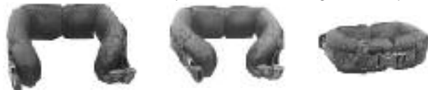
EI Lateral System Open Partially closed Closed and buckled