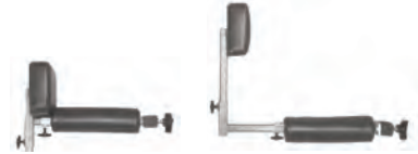
Height Adjustable Pommel With Rigid Hip Pad

Custom Support Pads: Use this area only if you need custom-sized support pads on your Superstand. All custom pads must be quoted for price and manufacturing time.